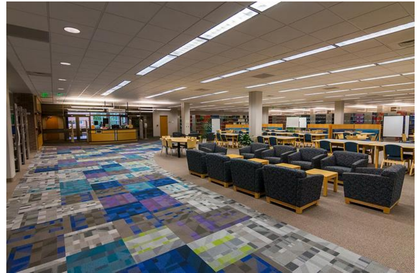
new carpet on the main floor